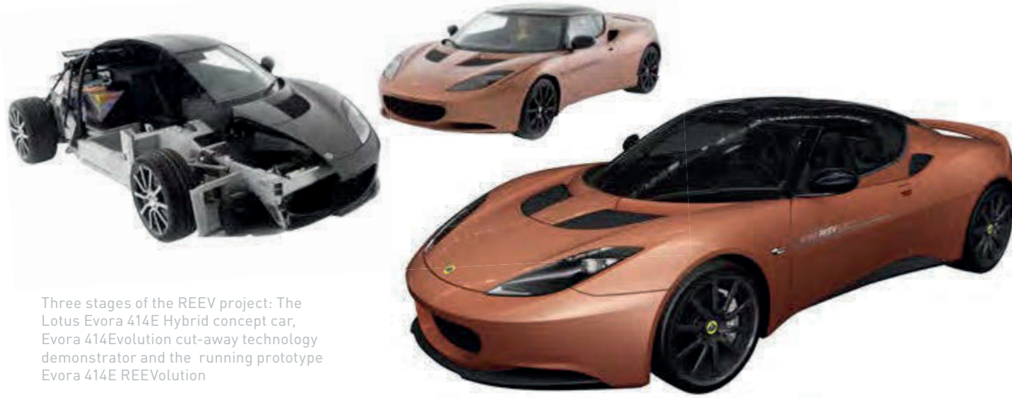
Three stages of the REEV project: The Lotus Evora 414E Hybrid concept car, Evora 414Evolution cut-away technology demonstrator and the running prototype Evora 414E REEvolution